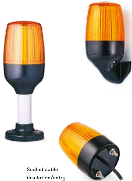
Sealed cable insulation/entry