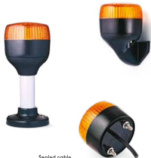
Sealed cable insulation/entry